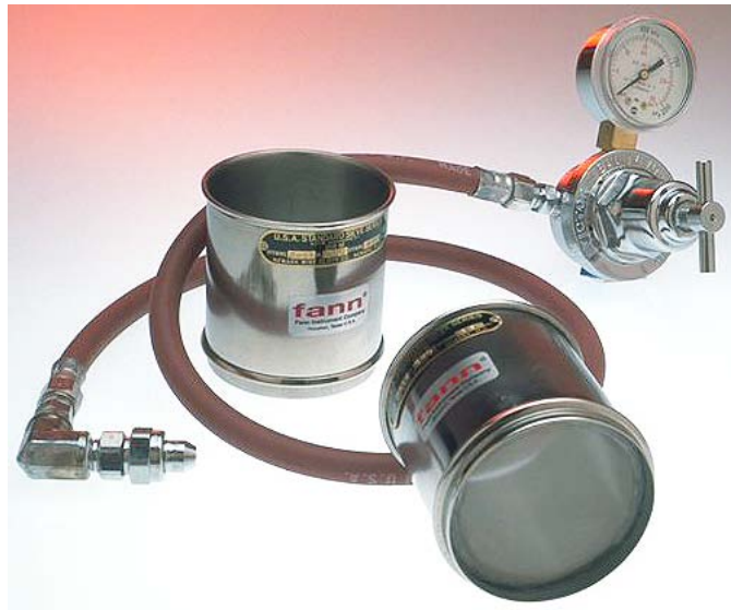
Figure 3-1 Wet Sieve Analysis Kit

The complete system contains all the components required for a connection to a water source. The flow pressure regulator is rated for 125 to 200 psig inlet pressure. The outlet pressure is adjustable from 0 to 15 psig. A low pressure 3-ft hose with a spray nozzle is included. The spray nozzle has a number TG 6.5 tip with a 1/4 TT body and is attached to the hose with a 1/4 FNPT stainless steel 90° elbow. This spray assembly is recommended in the API SPEC 13A.