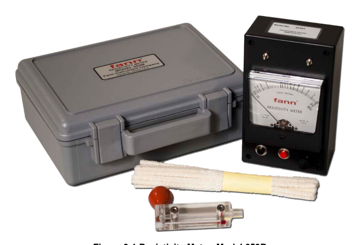
Figure 3-1 Resistivity Meter, Model 653B