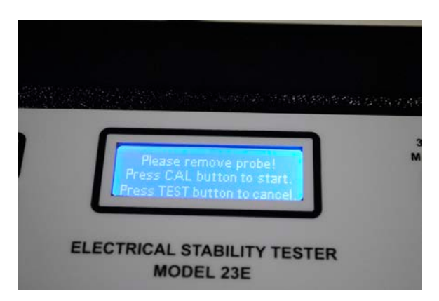
Figure 6-2 Self Calibration Mode

3. The calibration is in progress when the voltage ramps up to approximately 1200 V. Wait for the voltage to ramp up twice; after the first ramp, there will be a brief pause and the calibration process will repeat. Then a message will appear, "Calibration Completed." Now, the instrument is ready for your tests.