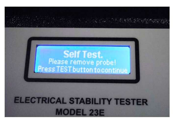
Figure 5-1 Self Test Mode

1. Push the ON button. Wait for the following messages to appear (Figure 5-1).