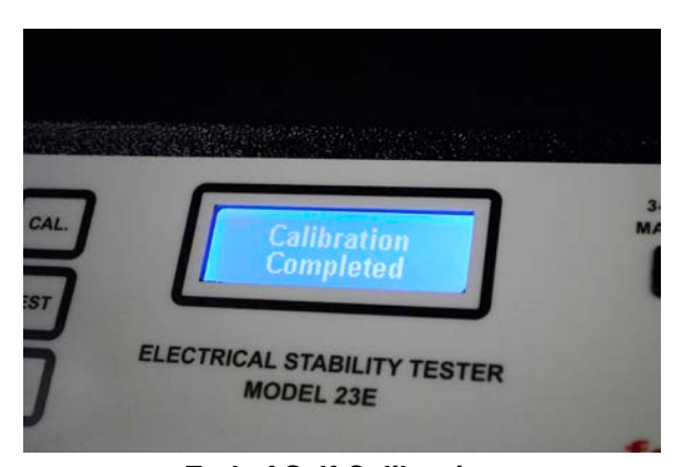
End of Self Calibration

3. The calibration is in progress when the voltage ramps up to approximately 1200 V. Wait for the voltage to ramp up twice; after the first ramp, there will be a brief pause and the calibration process will repeat. Then a message will appear, "Calibration Completed." Now, the instrument is ready for your tests.