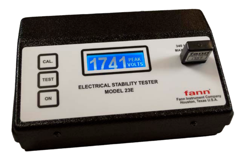
Figure 6-3 Sample Calibration Mode