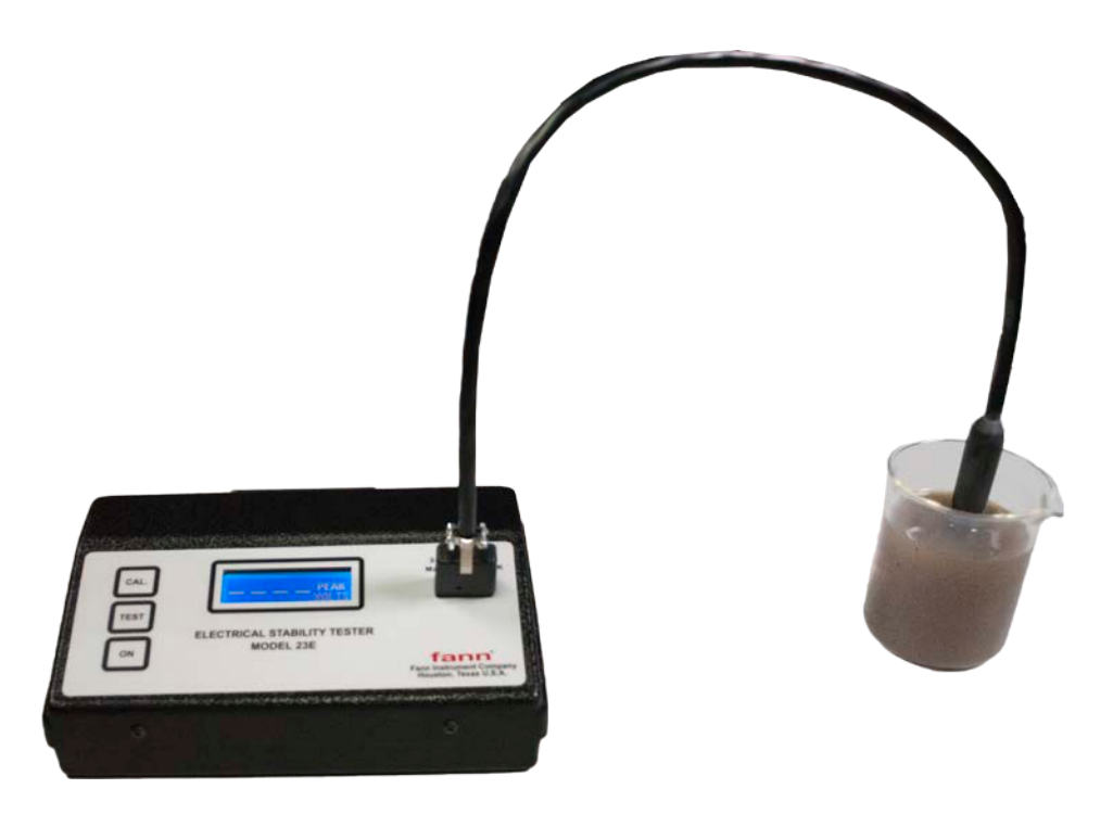
Figure 5-2 EST Probe immersed in sample