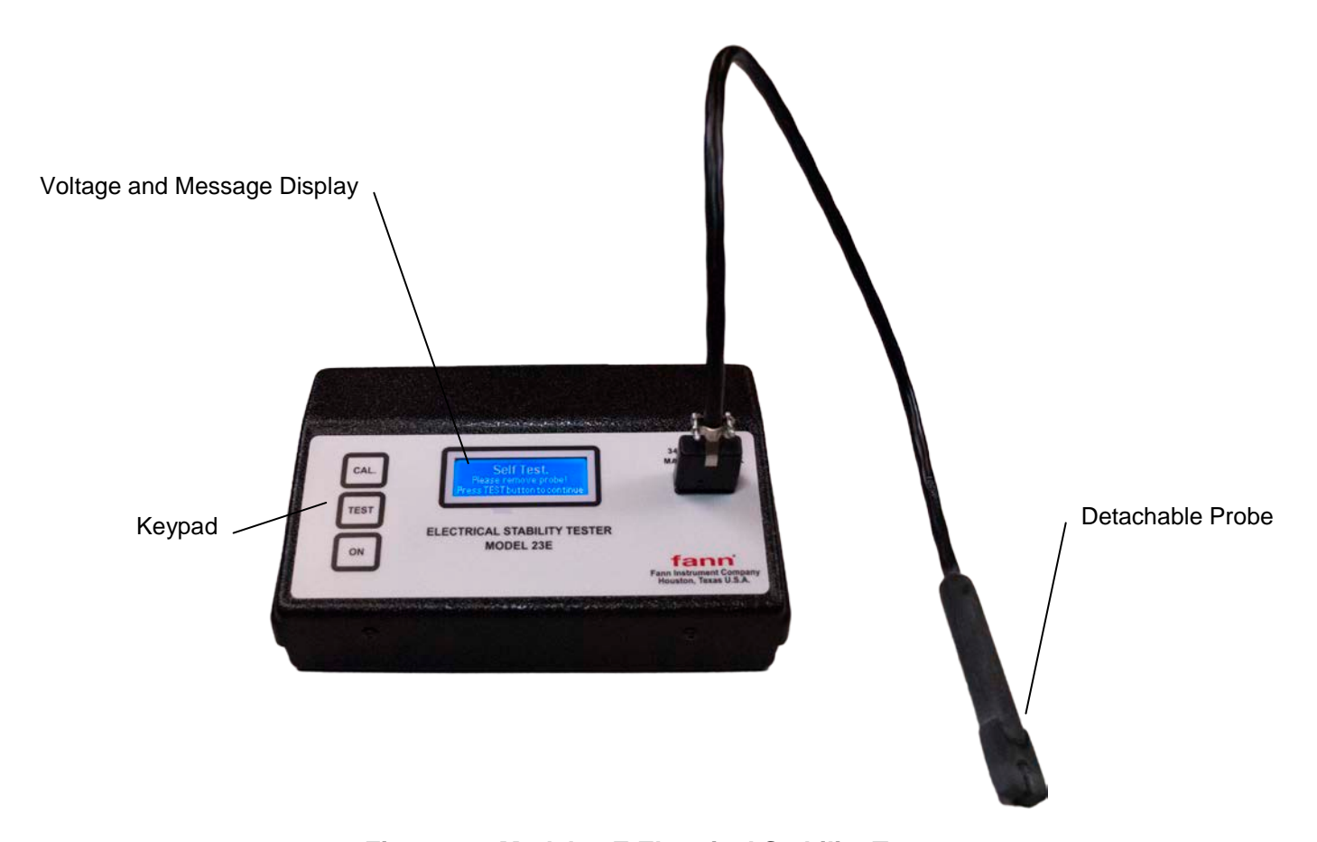
Figure 3-1 Model 23E Electrical Stability Tester

The specifications are listed in Table 3-1.