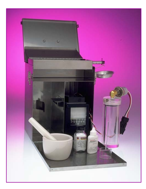
Model 43210 Recording Calcimeter

These instruments comply with the ASTM D 4373-84 STANDARD TEST METHOD FOR CALCIUM CARBONATE CONTENT IN SOILS. This test method is under the jurisdiction of ASTM Committee D-18 on Soil and Rock and is the direct responsibility of Subcommittee D-18.13 on Marine Geotechnics.