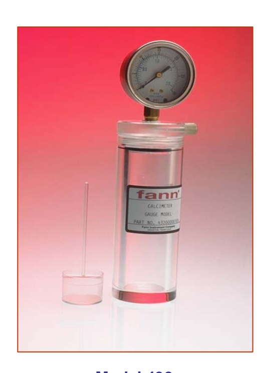
Model 432 Gauge Calcimeter

In Fann Calcimeters the calcium carbonate and magnesium carbonate are reacted with 10 % Hydrochloric Acid to form CO<sub>2</sub>. This is done in a sealed reaction cell and the pressure build up due to the CO<sub>2</sub> is measured using either a pressure gauge or a pressure recorder. The use of a Calibration Curve, determined through the use of pure Calcium Carbonate reagent, allows the pressure developed to be related to the weight of calcium carbonate in the calibration sample. Several weights of sample are suggested to provide an accurate curve. These tests can be conducted using either the pressure gauge or recorder with the reaction cell. The sample can be weighed on a portable balance with 10 mg precision.